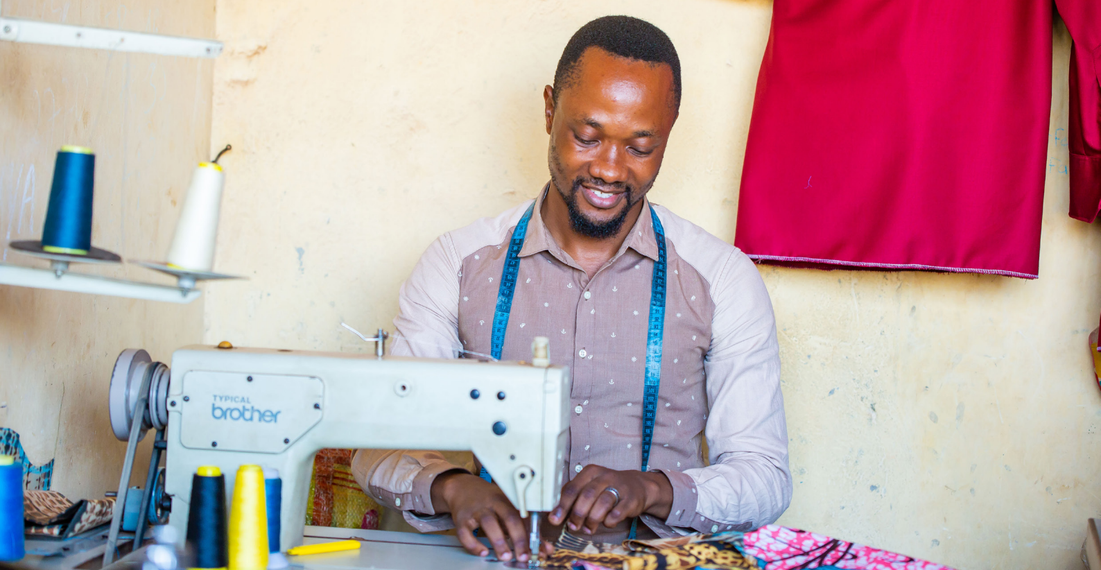
A refugee tailor at work in Kampala. The textiles sector is a popular livelihoods activity among refugees and hosts in Kampala and Nairobi.