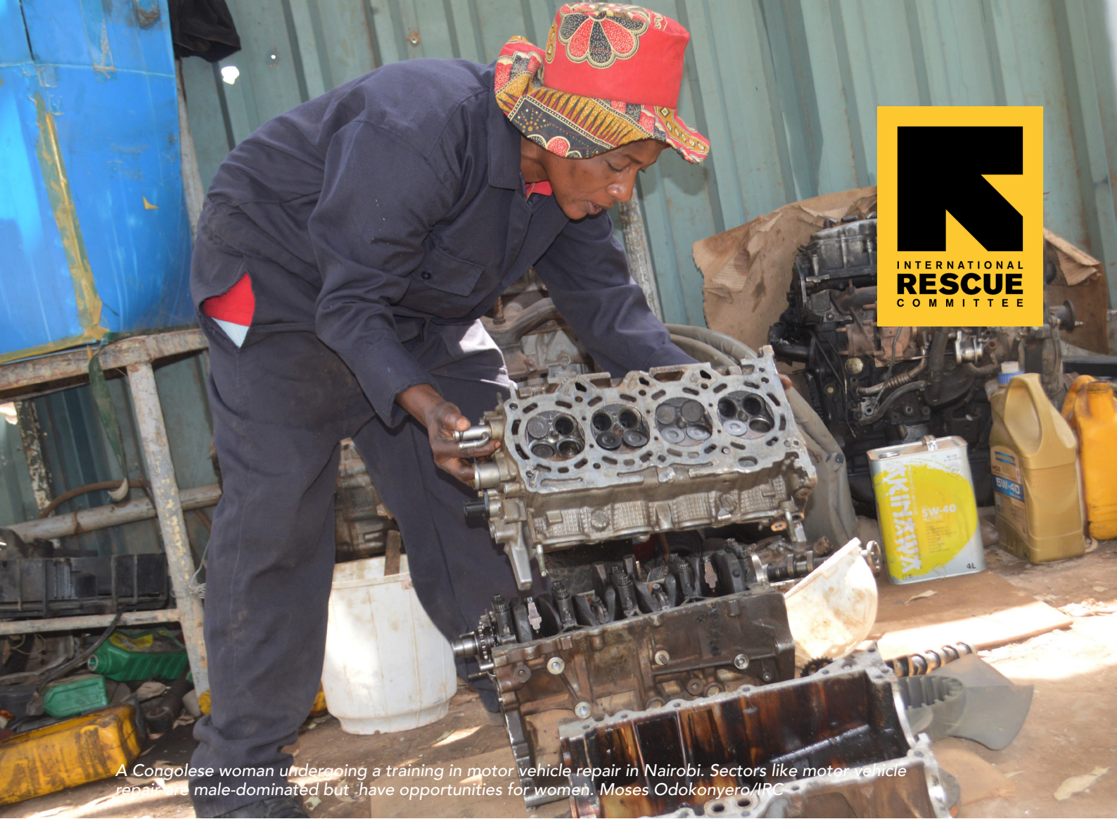
A Congolese woman undergoing a training in motor vehicle repair in Nairobi. Sectors like motor vehicle repair are male-dominated but have opportunities for women.