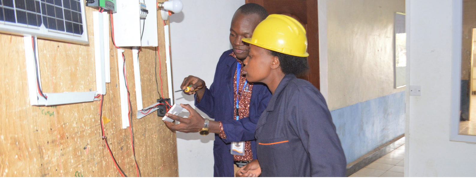
E-waste disposal, Nairobi, Kenya.